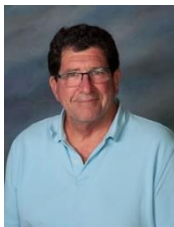
Nominee for NEA Delegate