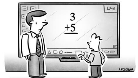
"I'm just saying, with all the computing power in this electronic board, I bet it could take care of this itself."