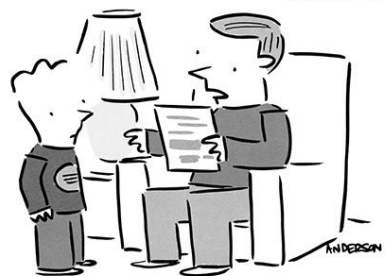
"I'll be happy to sign your report card, but I'm going to need to see an unredacted version first."