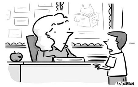
"Do independent clauses get to write off dependents?"