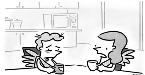
"I know it's Valentine's Day, but you look terrible. Can't you call in lovesick?"