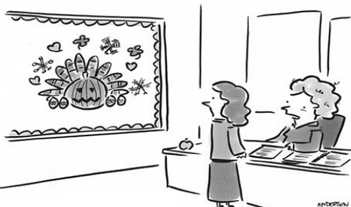
"It's been a busy year."